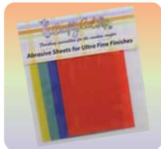
Product Number: #8802

Kit Contains: 1 Sheet of each grit 150, 320, 400, 600 & 100