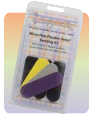
Product Number: #5801

Kit Contains: 3 Black Rubber Holders 2 Pads of each grit: 320, 400 & 12 000