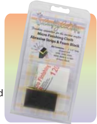
Product Number: #5300

Kit Contains: 1 - 2" X 8" Strip of each grit 3200, 3600, 4000, 6000, 8000 & 12 000 and Foam Block