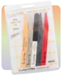
Product Number: #8525

Crafty Cat's Crafting Files put a new angle on crafting with improved versatility and convenience! Padded support in a handy 1/2" x 6" size, provides evenly distributed pressure over the boards on concave and convex surfaces. Ideal for sanding and blending materials of dissimilar texture and hardness, without digging in or scratching. Whether you work with wood, metal, stone, plastic or fibre there is a Crafty Cat Crafter's File right for your unique crafting application!