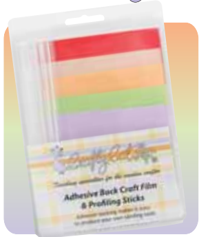
Product Number: #5204