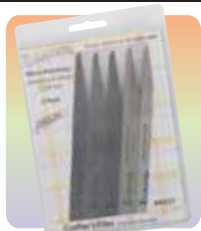
Product Number: #8527

Kit Contains: 1 file of each grit Dark Purple - 100 Grit Light Purple - 150 Grit Dark Green - 120 Grit Light Green - 220 Grit Orange - 240 Grit