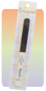
Product Number: #8321