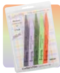
Product Number: #8526

Kit Contains: 1 file of each grit Peach - 320 Grit Tan - 600 Grit Triple Grit Polisher/Finisher Grey - 800 Grit Red - 1000 Grit