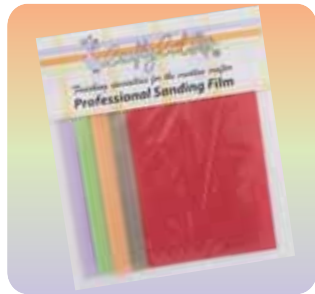
Product Number: #5201

Kit Contains: 1 Sheet of each grit 150, 320, 400, 600 & 1000 and 3 profiling shapes